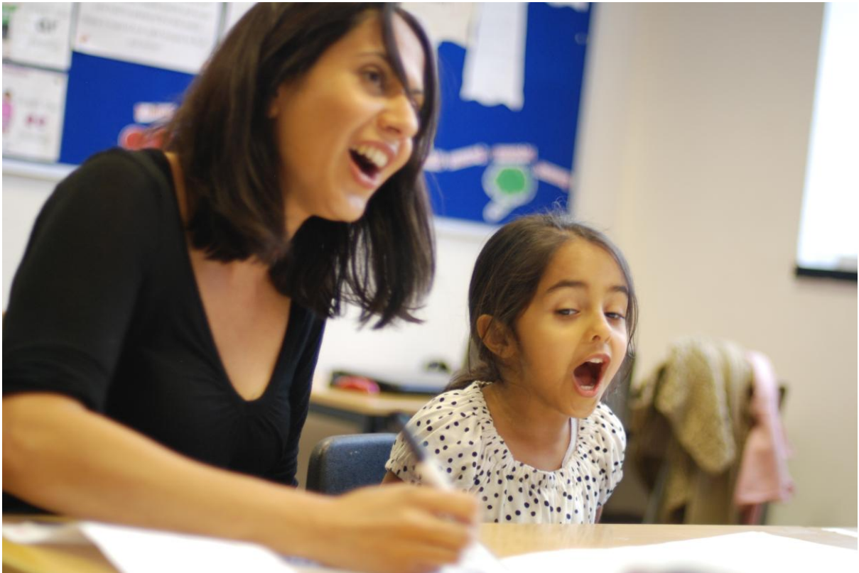
Stop cheating mum !